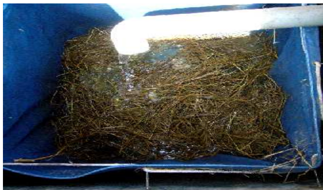
Fig. 17: Increased blackwater flow in the composting chamber (filter bag) due to water leakage in the flush toilets.

In this project, the total wastewater flow was calculated correctly, but the constructed wetland for greywater only receives 1.5 m 3 per day and the constructed wetland for blackwater more than 4 m 3 , sometimes up to 6 m 3 per day, mainly because the seals in the flush toilets do not close tightly or the flushing device is not used correctly. The high water flux to the compost filter bag dissolves a lot of solids, which are then transported to the wetland (see Fig. 17).