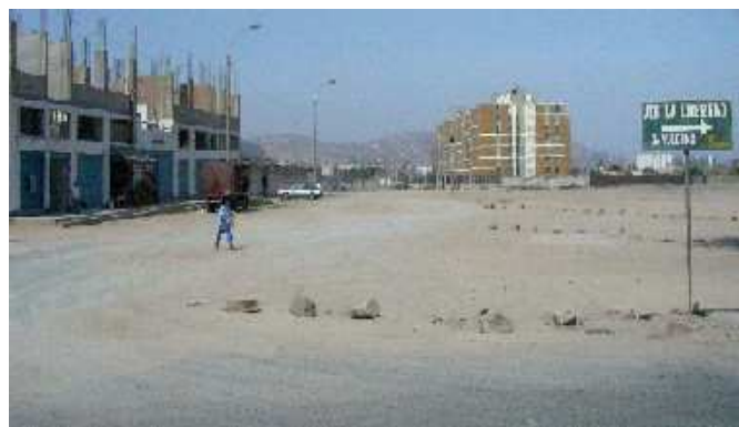
Fig. 13: Behind the fence: Desert living areas in the direct neighbourhood of the San Christoferus education centre.

Today the school has doubled the irrigated green areas, but reduced by half the water consumption compared to 2007. Comparing the school area with the surroundings, the advantage of reusing treated black- and greywater for irrigation becomes obvious (see Fig. 13 and 14).