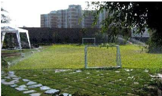
Fig. 15: Recently planted soccer field irrigated with treated blackwater (formerly a dusty area)

The project is helping the school to develop more outdoor activities for the handicapped children, which was lacking in the past due to the school grounds being extremely dry and dusty. The new playground was built in 2007 and today, the whole school area (0.6 ha) gets irrigated and was turned into green space (see Fig. 15). The presence of trees, flowers and herbs gives the possibility to develop the senses of the children.