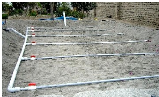
Fig. 18: Distribution system on the second constructed wetland (for blackwater treatment) before planting, showing valves on the left (in red) to avoid clogging (intermittent loading).

The compost filter system for blackwater pre-treatment was never used before in Peru. Operation showed that it is a very good system for warm climates. The composting process is rapid. If used for post-treatment, a three-month composting period without adding further blackwater is enough to properly treat the content of the filter bag.