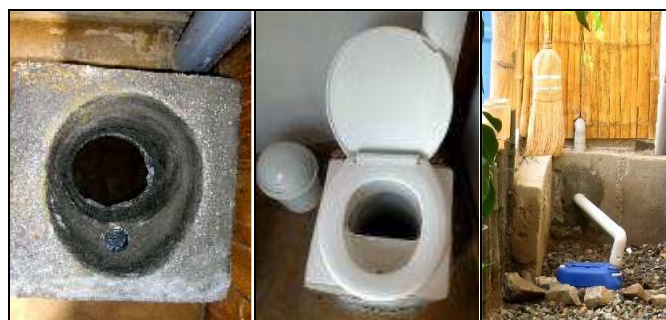
Fig. 12: Toilet seats without (left) and with (middle) plastic insert for urine separation. Pipe from UDDT toilet to 25 L urine jerrican (right).