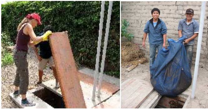
Fig. 6: Double-chamber compost filter ("Rottebehälter") for blackwater pre-treatment (left) and removal of a filter bag (right)

In October 2008, a second vertical flow constructed wetland started operation which is now used alternating with the existing wetland to improve treatment efficiency.