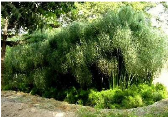
Fig. 8: Vertical flow constructed wetland (reed bed) for treatment of the liquid phase of blackwater (after 6 months of growth)