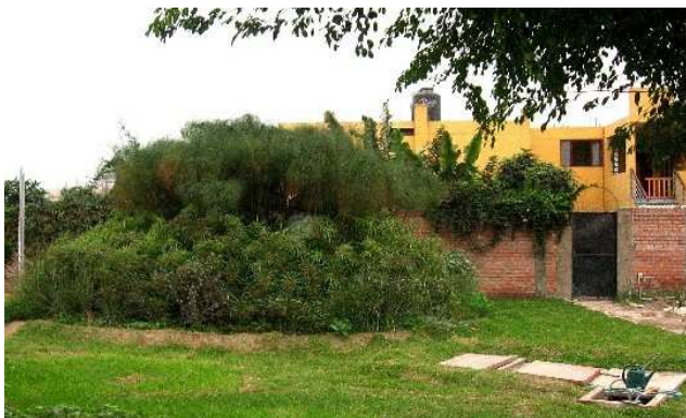
Fig. 19: Constructed wetland (reed bed) for greywater treatment planted with two species of Papyrus, after 1 year of operation.