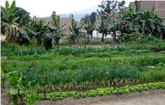
Fig. 14: Urban agriculture at school, irrigated with treated blackwater

(Vermi-) composted organic material from the kitchen and the garden as well as solid material and dehydrated faeces from the UDDTs is reused for soil improvement.