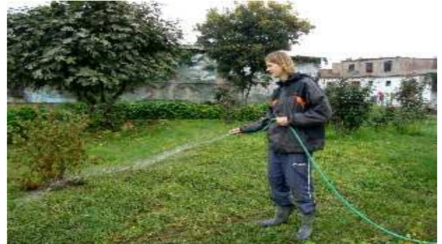
Fig. 16: Daily garden irrigation (in this case with treated blackwater) in the dry climate of Lima.

An even more important task is the organization of the daily reuse of the treated grey- and blackwater (see Fig. 16), because unfortunately the irrigation system is not working automatically. In the beginning of the project, the effluent tanks often overflowed and the water in the wetland dammed up due to irregular irrigation practices. The operation is organized by the gardener (housekeeper) and by German volunteers, who work there for a year.