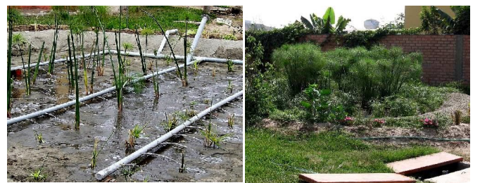
Fig. 5: Vertical flow constructed wetland for greywater treatment during pumping (a day after planting and before the protection of the distribution pipes with a 10 cm gravel layer) (left) and after two months, with storage tank for irrigation of treated greywater (right).

Interested in the new playground, many families and school classes came to visit the school. It became necessary to have an additional outdoor toilet for visitors near the playground. In March 2008, Rotaría del Perú provided the idea for a waterless urine diversion dehydration toilet (UDDT) and financed all materials. The objective was to demonstrate the applicability of this type of toilet for schools and to showcase a dry sanitation system as a possibility to reduce water consumption and avoid water pollution. Also, the construction of an outdoor flush toilet and its pipe connection to the wetland would have been much more expensive.