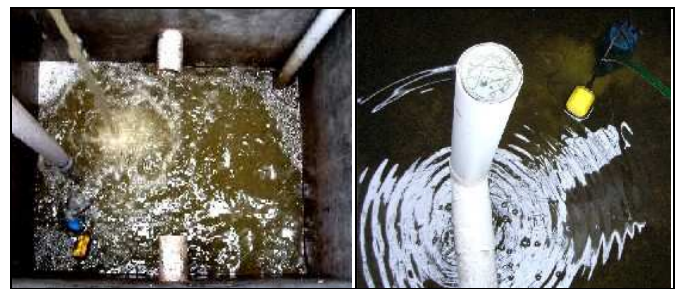
Fig. 4: Outlet of the blackwater compost filter (pre-treatment) (left) and effluent of the constructed wetland (papyrus reed bed) for blackwater treatment (right).

Already the first weeks of operation for the wastewater treatment system were a success. Everybody was impressed by the excellent treatment results and later surprised by the intensive plant (papyrus) development in the constructed wetland.