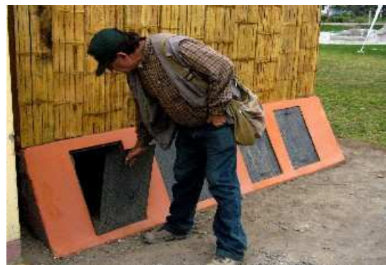
Fig. 11: Two double-vaults for faeces collection at the backside of the UDDT building (4 vaults in total).