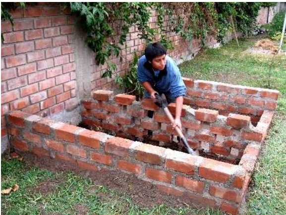
Fig. 7: Spreading of the retained solids from the filter bag, after 6 months (see Fig. 6) on the vermicomposting bed on a concrete slab