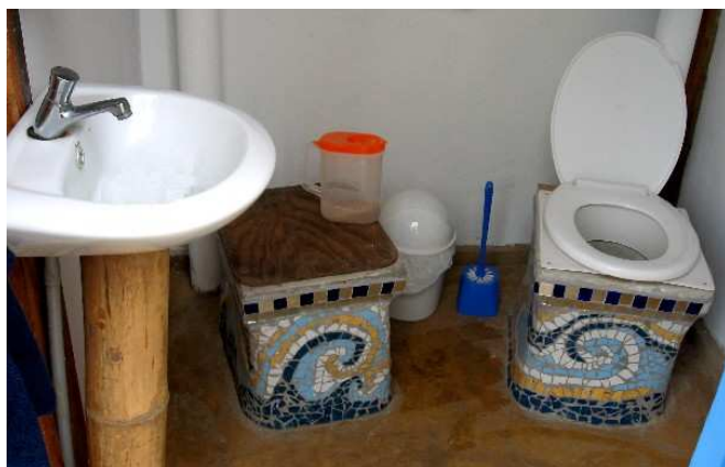
Fig. 10: Inside one UDDT cubicle (Two colourful urine diversion pedestals; only one is in use at a time, for about one year).