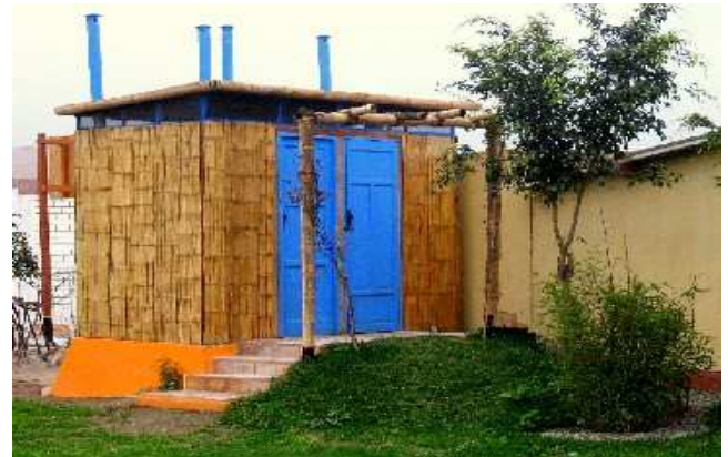
Fig. 9: Outdoor UDDT with gravel filter bed for greywater (right hand)

Besides the compost filter system and the vermicomposter, two other composting systems already existed before 2007: compost holes for organic kitchen and garden waste and compost heaps for biowaste from agricultural production and gardening.