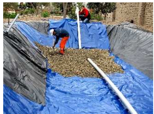
Fig. 3: Drain tube on the base of the constructed wetland for blackwater treatment during covering with gravel. To avoid perforation caused by the gravel, the 0.5 mm PVC liner (in black) needed a special protection. A second liner (in blue) was put inside. 1