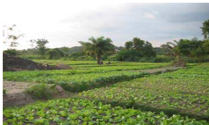
Fig. 6: Lettuce farm fertilised with compost at Gyenyasi farmers Association in Kumasi (source: Nikita Eriksen-Hamel, 2002).

The farmers who were skeptical (17%) feared that the excreta component could still spread infections and thought that consumers might avoid crops being fertilised with excreta-based compost (there is however no evidence that consumers would avoid crops that were fertilised with excreta-based compost).