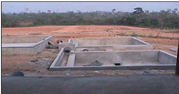
Fig. 4: Faecal sludge drying beds.

FS (excreta mixed with water) is collected from unsewered public toilets (type of toilet is described in Section 3) and household septic tanks by vacuum trucks within the city of Kumasi and transported to the project site for drying on sludge drying beds. Due to its too high moisture, fresh FS is unsuitable for direct aerobic composting. Hence a solid-liquid separation is needed to produce sludge of adequate water content for co-composting. For solid-liquid separation, sludge drying beds including a sand-gravel filter medium for drainage were built. They are loaded with the faecal sludge (a mixture of public toilets sludge and septic tanks FS in the ratio of 1:2). The drying process is enhanced by evaporation and gravity percolation.