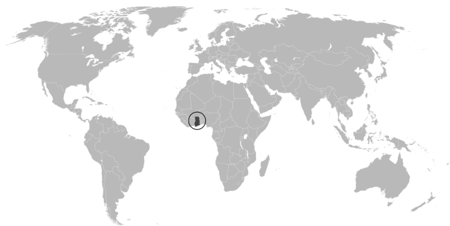
Fig. 1: Project location