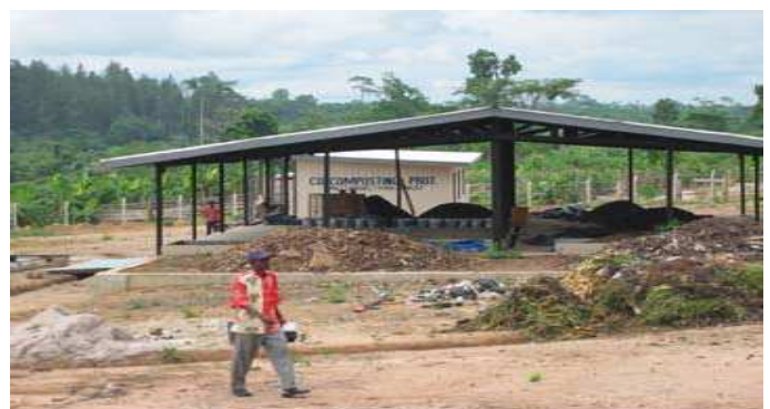
Fig. 3: Co-composting facility (open windrow system) in Kumasi.

Kumasi is the second largest city in Ghana, West Africa. The city has 1 million inhabitants (growth rate of 3% per year).