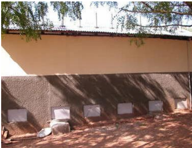
Fig. 6: New "compost" pit latrines for patients, rear view, showing access openings for the removal of faecal sludge