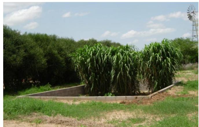
Fig. 8: Constructed wetland in 2006