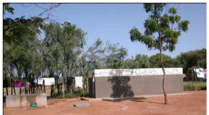
Fig. 3: Shower and laundry washing area of the Health Center

In Uganda, the under-five mortality rate 1 is currently 130 children per 1000 ( http://www.childinfo.org/mortality.html ).