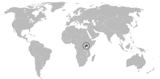
Fig. 1: Project location