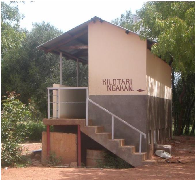
Fig. 5: New "compost" pit latrines for patients after reconstruction, side view