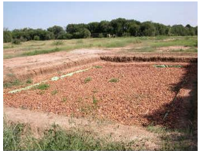
Fig. 7: Constructed wetland (5m x 9m) before greening in 2004

The inlet of the constructed wetland comprises coarse aggregate (diameter of 60-80 mm) in order to distribute the wastewater horizontally before it enters the actual treatment part consisting of sand (diameter of 4-8 mm). The bottom of the filter bed has a slope of 1%. At its lower end another area of coarse aggregate including a drain pipe (PVC DN 100) collects the purified wastewater which is piped via an outlet manhole to an underground percolation ditch in the nearby reforestation area (10m of drain pipe DN 100 in a layer of coarse aggregate and covered with excavated material and soil).