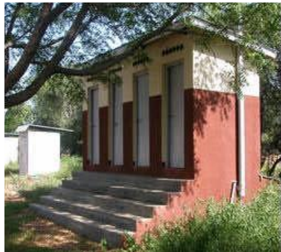
Fig 4: New UDD toilet block with 4 cubicles for the staff