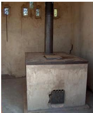
Fig. 9: Medical waste incinerator constructed on the Health Center's compound, 2004

A low cost medical waste incinerator based on a project of the Applied Sciences Faculty of De Montfort University in Leicester was constructed. Burnt residues are disposed in a covered and fenced dumping area, built on request of the project owner.