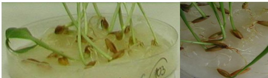
Figure 1: Winter barley roots trying to avoid the contact with the liquid and oat roots getting brown and curly. The UW mix contains the 1000fold dosing (compared to an expected concentration in AGU) of ibuprofen in its urine part.

Aside, a visual effect could be observed in the case of ibuprofen (Figure 1). The roots of all cereals tried to avoid the contact with the UW mix containing ibuprofen. This was shown best for rye. This observation was not reflected in the statistical analysis.