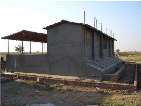
Urine Separating Dehydration Toilet (2 chambers) with showering facilities

Total construction costs: 5'000 – 5'500 €