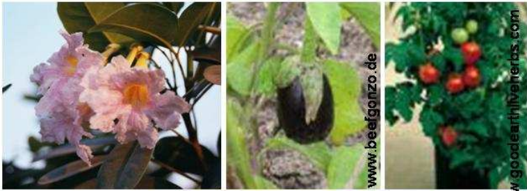
Ornamental & Vegetable Garden