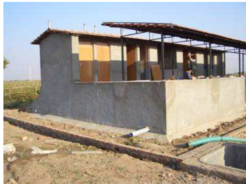
New School Toilet