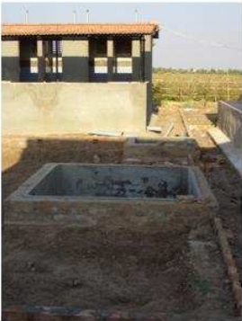
Vertical Flow Filter