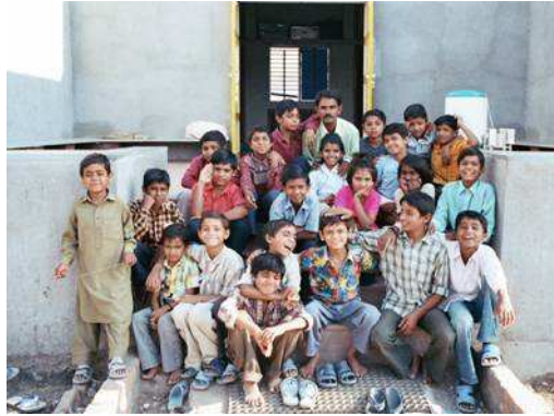
5th Grade Class