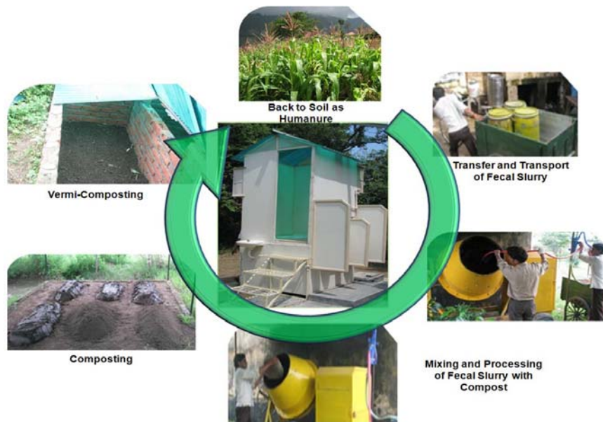
Photograph 1. Pictorial representation of the various operations involved in converting human excreta into quality manure

Nutrient Recovery from Flush Solution: The results of study on evaporation and concentration of excess flush solution reveal that the lowest evaporation rate is about 1.5 liters/sq.m/day during November through February and the highest about 7 liters/sq.m/day during the months of March through May. There was no change in the pH of the flush water. The variations in mass of TKN, phosphorous, and potassium as fraction of reduction in volume of flush solution are shown in Figure 2. About 70-75 % reduction in volume of flush solution occurs on evaporation in practice. There is essentially no loss of phosphorous and potassium throughout the cycle period. However, TKN is lost during the evaporation cycle. The loss is perhaps due to volatilization of ammonical nitrogen.