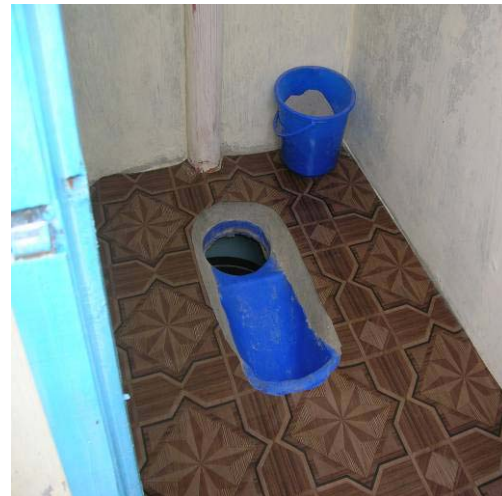
Photograph 3. Inside a UDDT –note the squatting U-D pan and the bucket of ash.