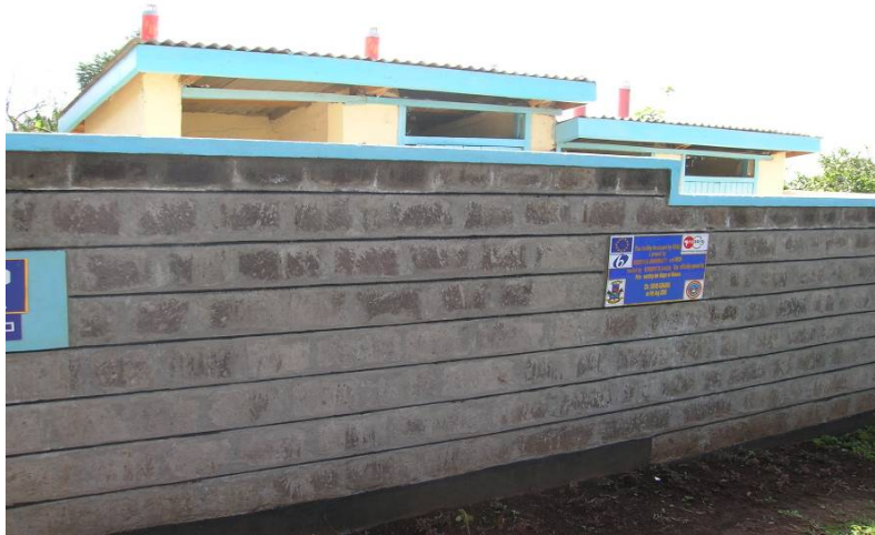
Photograph 1. Completed Pilot UDDT in Nakuru, Kenya.

space is enough to allow up to four 50 litre containers to fit in. Once a container fills, it is pushed aside to allow an empty bucket to be placed below the hole and the full one to dry. It is recommended that the filled container remains in the vault for a period greater than six months to allow pathogen die-off (WHO, 2006). Urine is collected in a 30 litres plastic container. For the mentioned facility, provision is made for discharging the excess urine through an over flow pipe into a soak away pit, with the possibility to collect the urine for a later use.