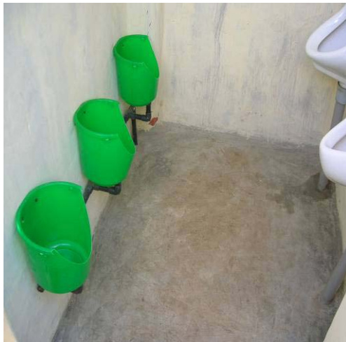
Photograph 2. Water less urinals- green ones for nursery school children.