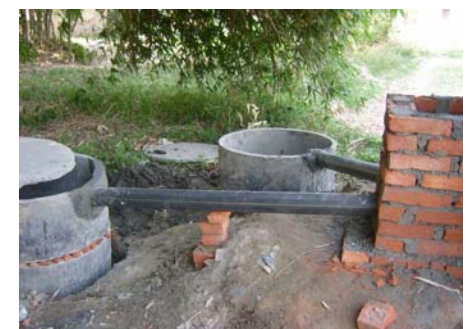
Fig. 5: Concrete rings at twin pits