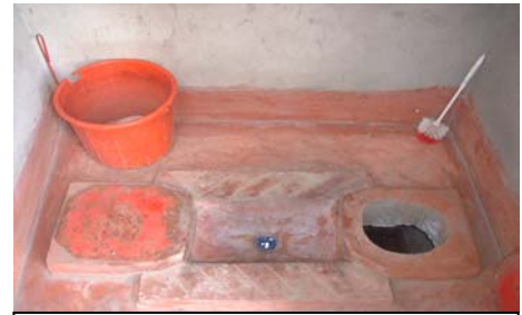
Fig 2: First Ecosan pan developed in Sidhinur

After imparting on-site training to the local masons to build pans, a mason from the same community made few pans and showed to the villagers for its suitability. The pans were experimented by men and women in the community for few days. Then the pans were modified to ease bottom cleansing and stop splash of urine. The mason kept modifying the pan until the users were fully satisfied (Fig. 4).