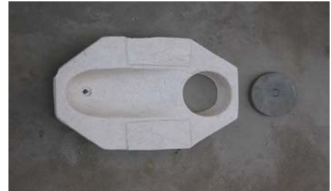
Fig 3: Ecosan pan modified by ENPHO