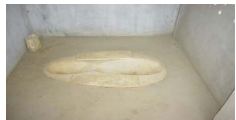
Fig 4: Ecosan pan modified in Parsa