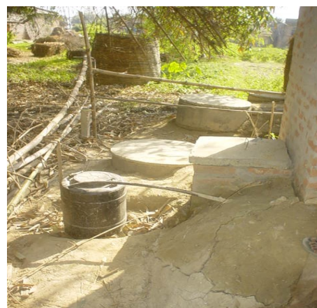
Fig 1: Plastic jar for urine collection

Therefore, a unique wet Ecosan latrine was designed particularly for Terai , in such way that human faeces are simply disposed alternatively in twin pits lined with concrete rings. Once one pit is filled up, the faeces is then disposed to another one, and vice versa. In such latrines, as sludge volume is reduced due to provision of soaking action of liquid, the cost of this type of latrine is less. In case of urine, it is stored in a separate plastic jars (Fig. 1). In this model, bottom cleansing can be done at the hole of the pan itself, which are more users friendly as compared to dry latrines. Pan being water sealed, people can clean the pan with water and hence the latrine can be maintained clean and odorless. Moreover, the use of wet latrine is also simpler than dry latrine. Specifically visitors and guests can also use the latrine easily with a little instruction.