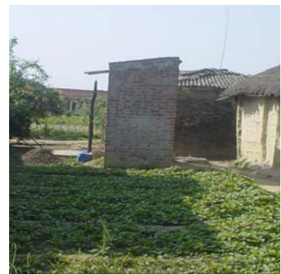
Fig 6: Urine application in potato in Parsa

Even before the Project, they used to apply faeces and urine in the farm unscientifically. But the project helped them to use faeces and urine as manure scientifically. A Nepali proverb saying Pet ko Khetma, Khet ko Petma (from stomach to farm and from farm to stomach) is very much applicable in Khokana. The proverb which is being used since centuries denotes the correlation of faeces/urine and crops. In other words, what has been developed in the farm is useful to the stomach and vice versa.