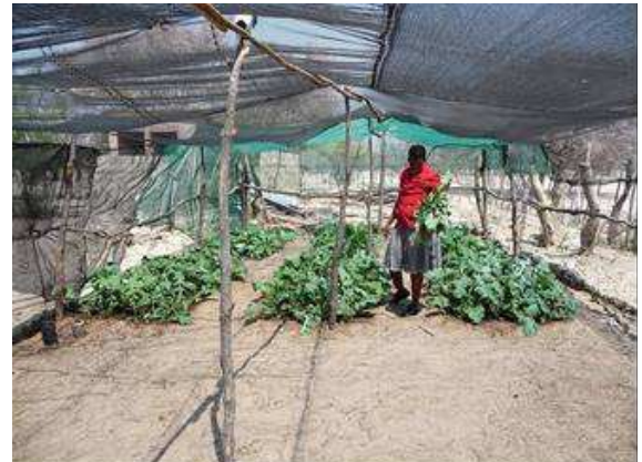
Fig. 8: The garden of Gome Petros where the urine is used to fertilise the plants.

noted again that the amount of human fertiliser produced by one household was not enough for the backyard garden of that household. Surprisingly, in Paje, where the vegetable trials had been very successful with the participating households during the project implementation phase, the majority of villagers remained skeptical and still considered reuse of excreta a taboo.