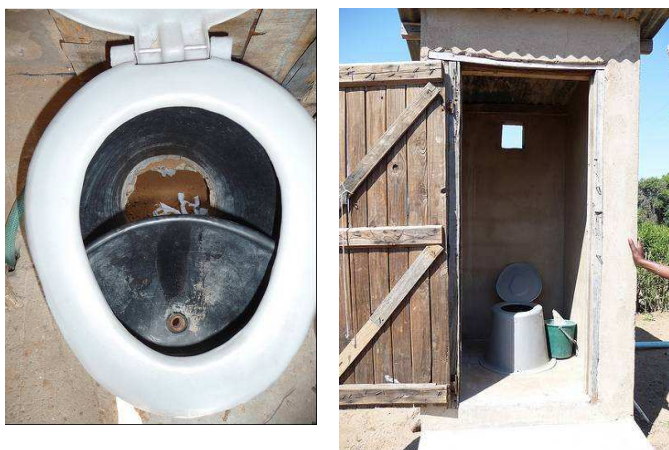
Fig. 7: Left: UDD toilet working properly in West Hanahai. Right: This UDDT was well maintained, ash standing next to the toilet and composting unit filled (in Paje).