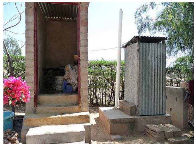
Fig. 9: UDDT next to pit latrine (where, Paje or Hanahai?). The UDDT was never used since its installation in 2004 (as the main female of the household objects to having to empty the faeces container. The pre-existing pit latrine is used instead. (what happens when pit latrine is full?).

In Paje, those families that already had pit latrines were not motivated to maintain a UDDT in the long-run. In all cases where two toilets were found on the same plot, the pit latrine was used and family members said that they either did not know how to handle the faeces and/or considered it to be 'yucky'. The parallel structures seem to account for an unwillingness to maintain the UDDT, in some cases because the decision to make a new toilet had not been taken by the woman who usually maintained the UDDT.