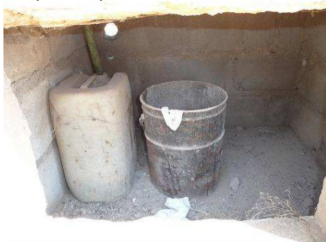
Fig. 6: Collection chamber under a properly working ecosan UDD toilet (left: urine container, right: faeces bucket) in Paje.

Greywater (used household wastewater) is often collected and applied directly to the trees etc. This practice was further supported by the project. The greywater was also used to keep the compost heaps moist.