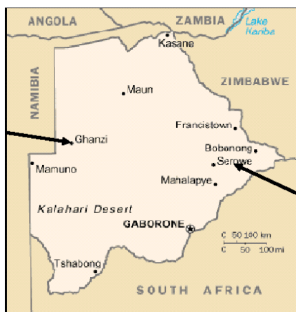
Fig. 4: Location of Paje Village (right arrow) and East and West Hanahai settlements (left arrow).

The relatively recent activities of livestock rearing and arable farming remain difficult to implement in the sandy soil and the extremely dry climate of the Kalahari Desert. The groundwater table is very deep, there is no permanent surface water, and households rely on reticulated water supply, mainly through public standpipes.