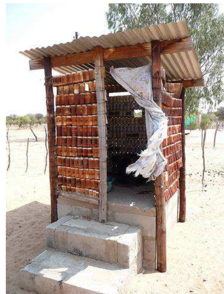
Fig. 5: Ecosan UDD toilet built out of beer cans in Hanahai. The most creative superstructure in the region!

There were some difficulties during project implementation. Notably, there were delays in making the super-structures of the toilets, mainly due to financial reasons and involvement of households in drought relief projects. Also, acceptance of the concept of using waste for composting purposes was a challenge. Fencing and proper protection of the backyard gardens was often neglected.