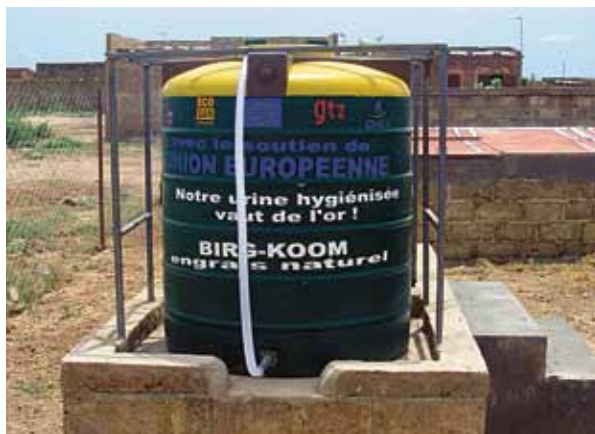
Figure 9. Plastic urine storage tank in Ouagadougou, Burkina Faso as part of the EU-funded project ECOSAN_UE led by CREPA.