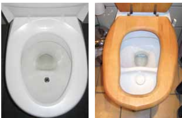
Figure 6. UD flush toilets. Left: Gustavsberg (in Meppel, the Netherlands); Right: Dubbletten (in Stockholm, Sweden); (sources: E. v. Münch, 2007).

UD flush toilets can also be combined with the concept of vacuum toilets (realised for example by the company Roediger for a pilot project in Berlin Stahnsdorf and by the Swedish company Wost Man Ecology, see Appendix ). This type of toilet collects urine and a small, concentrated amount of brownwater (faeces with about 1 L of flush water).