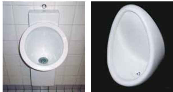
Figure 1. Waterless urinals for men. Left: Centaurus model of Keramag company. Right: Plastic urinal from Addicom, South Africa, with EcoSmell-stop device (sources: (left) E. v. Münch, Delft, 2006; right: Addicom).

Waterless urinals are the first and easiest step towards urine diversion and, possibly, ecological sanitation (ecosan).