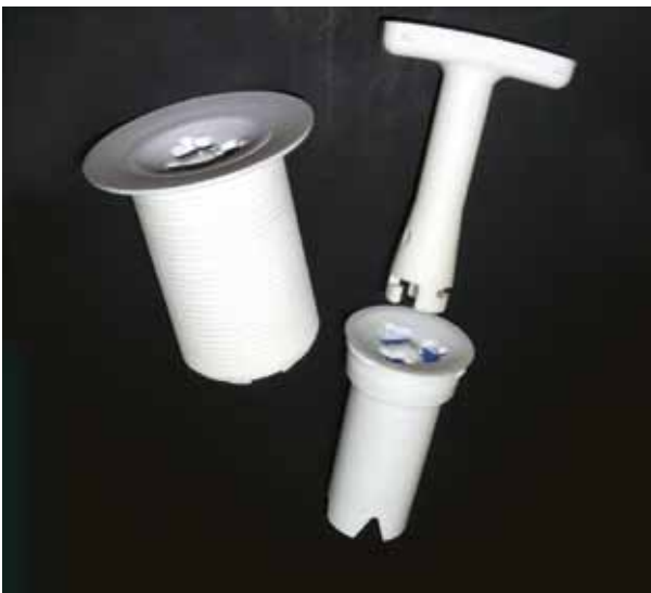
Figure 3. EcoSmellstop (ESS) unit with pipe fitting and extractor. Inside the ESS is the silicon curtain valve.