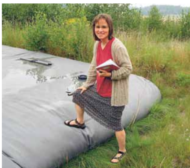
Figure 8. Urine storage tank made of a 150 m 3 plastic bladder at Lake Bornsjön near Stockholm, Sweden (photo commissioned by: E. v. Münch, 2007).