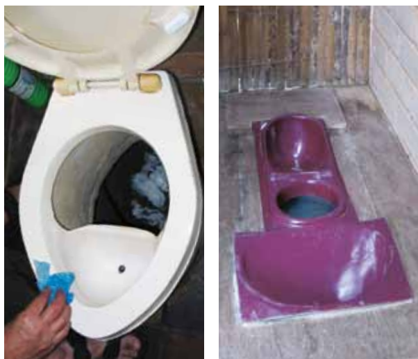
Figure 5. Left: Indoor UDDT (pedestal type) in Johannesburg, South Africa in the house of Richard Holden. Right: UDDT squatting pan in Bangalore, India, with three holes: the area in the front is for anal washing, middle is for faeces and back is for urine.

The anal washwater can be infiltrated in a gravel filter or treated together with greywater in a subsurface constructed wetland. UDDTs are especially popular wherever there is water scarcity and a demand for cheap fertiliser. They can be built indoors or outdoors.