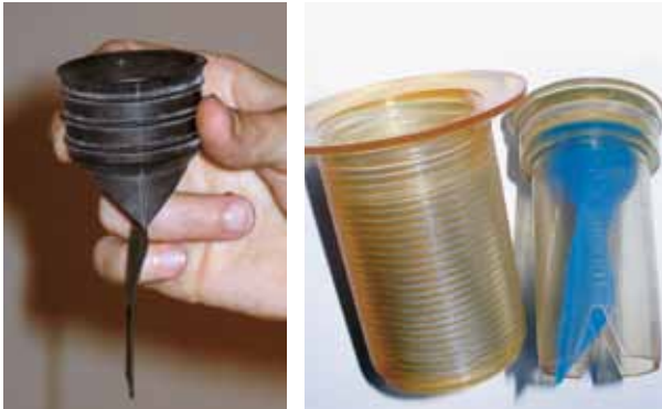
Figure 2. Two types of odour seals for waterless urinals. Left: Flat rubber tube (Keramag Centaurus). Right: (left side) See-through pipe fitting; (right side) see-through EcoSmellstop (ESS) unit showing the blue silicon curtain one-way valve inside.

The ESS manufacturing process is not simple as the injection moulds are of extreme complexity, and the mixing and injection requires very sophisticated machinery. For this reason, it is not yet possible to manufacture the ESS locally in developing countries, but it can easily be imported as it is small, light-weight and low-cost. This patented ESS unit is used by the companies Addicom, Kellerinvent AG and F. Ernst Ingenieur AG 15 since 2006.