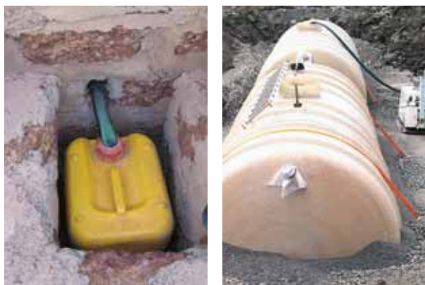
Figure 7. Left: Low-cost solution: 20 L plastic jerrycan for urine storage at individual toilet level in Ouagadougou, Burkina Faso. Note: it might be quite difficult to lift up a full jerrycan out of this enclosure. Right: Below-ground plastic urine storage tanks at Kullön, Sweden during the construction process. The tanks will be covered with soil.

Examples for urine storage tanks of different sizes are shown below.