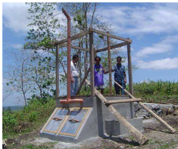
Fig. 10 Construction of a double-vault UDDT, barangay Narra, 2007

GTZ-Philippines personnel. From January 2009 onwards, monitoring of new facilities will be done by the ecosan TWG only.