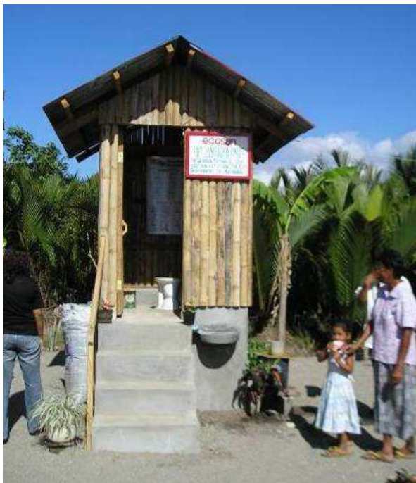
Fig. 5 Single vault UDDT, barangay Villareal, Bayawan City, 2006

The vast majority of rural households uses firewood for cooking, which means they have ash available. After defecation the faeces are covered with the ash to enhance the drying process and for optical reasons. In cases where no ash or not sufficient ash is available, carbonized rice hull 3 is used.