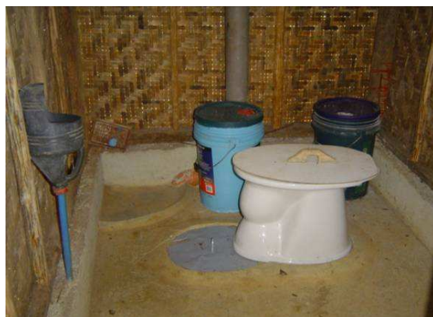
Fig. 8 Inside a UDDT, barangay San Miguel, 2008. Note waterless urinal on the left. Area for anal washing in the far left corner.

All UDDTs were built as outdoor toilets. The main reason for this was that the users felt at the beginning more comfortable with this conventional setting. Many users were concerned about insects and bad odours as it is known from simple pit latrines. Future UDDTs could also be built indoors.