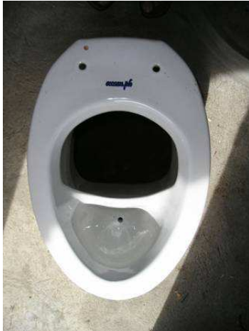
Fig. 4 Ceramic urine-diversion toilet pedestal, inside of the toilet house shown in next figure