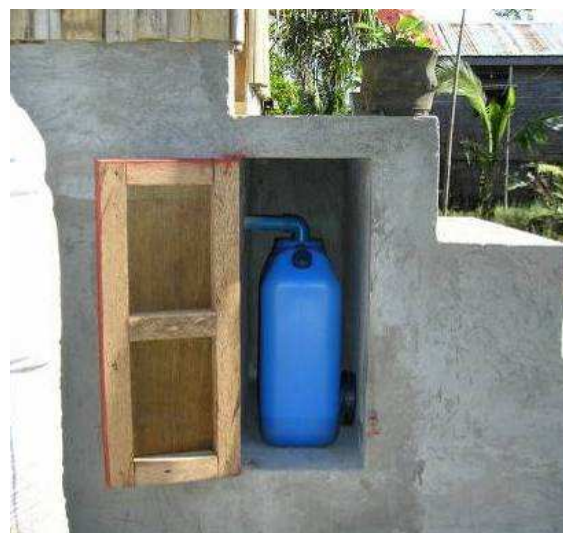
Fig. 9 Urine container, UDDT in barangay Villareal, 2007