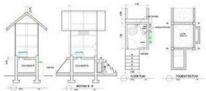
Fig. 6 Single-vault UDDT, technical drawings

The UDDTs are all built entirely above ground to facilitate high temperatures in the vaults and thus accelerating the drying process. Therefore the buildings have a small staircase. The number of steps varies, depending on the individual design. The standard design has 4-5 steps of 20 and 25 cm width and height, respectively.