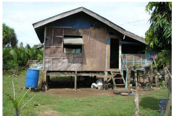
Fig. 3 House of a family with a UDD toilet, barangay Villareal, Bayawan City, 2006

Note: The focus of this document is on Phase 1 of the project (Phase 2 is only mentioned for completeness).