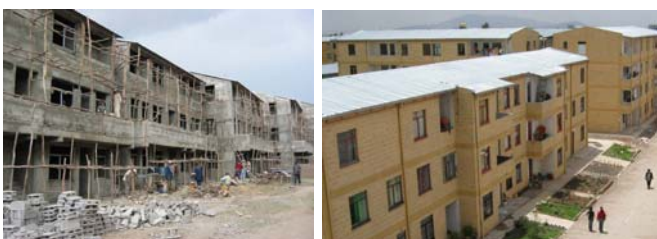
Multi-storey condominium houses during construction and after finishing

The Ethiopian government is currently pursuing large housing programmes to address the constant population growth and migration to cities. The multi-storey houses regularly face problems with regard to water supply and sanitation. Therefore, urine-diverting dry toilets were adapted for the use in multi-storey buildings.