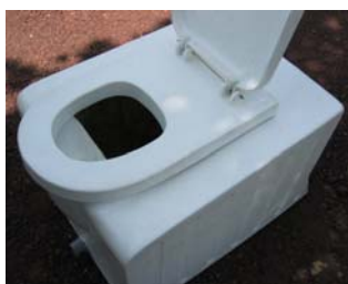
Urine-diverting sitting toilet (fibreglass)

The urine is separately collected in large storage tanks outside the houses from where it is regularly collected and transported to agricultural areas. Urinals are installed for convenient collection of urine.