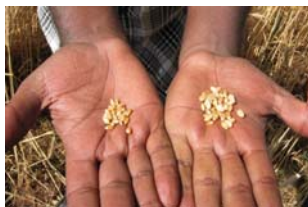
Wheat fertilised with DAP (left) & urine (right)

Awareness raising, crop trials and training of farmers has been carried out to promote the use of urine and compost as fertiliser and soil conditioner.