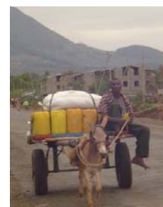
Transport of urine and faeces

A cost analysis showed that investment costs are comparable to the implementation of septic tank systems. Operation and maintenance can be done in an adapted and cost-efficient way. Replacing mineral fertiliser by urine can result in additional monetary benefits particularly in the light of rising fertiliser prices.