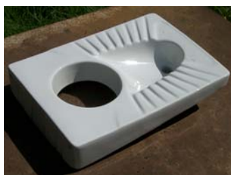
Urine-diverting squatting toilet (ceramic)

The urine-diverting toilets are based on the double-vault system with two toilet boxes that are used alternately so that the faeces can dehydrate before they are pushed down a shaft at the rear of the toilet and collected at the bottom. Post-composting is recommended as treatment before application onto soil.