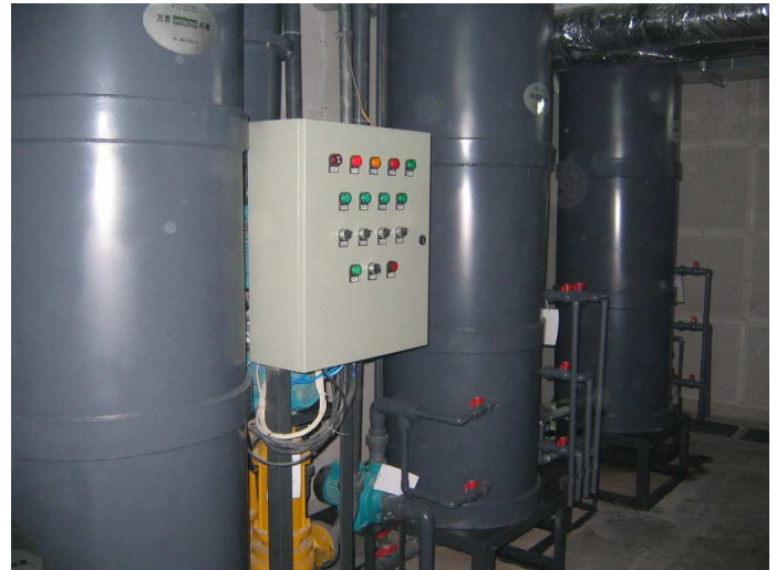
Fig. 5: Collection and storage station for the urine and brownwater

The collection and storage station in the basement consists of a urine storage tank, a brownwater (faeces + water) storage tank and a buffer tank for pressure compensation of the vacuum system. All three tanks have a diameter of 0.6 m and a height 2.0 m (volume 565 L). Two pumps with an installed power of 1.1 kW each generate a vacuum force of 0.4 to 0.6 bar. The vacuum in the air tight system is consistently maintained.