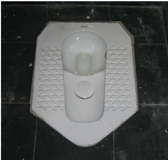
Fig. 4: Urine-diversion vacuum squatting toilet in the Sino-Italian Environment & Energy Building

Urine collected in the source-separation sitting and squatting toilets as well as the waterless urinals 1 is drained by gravity. Faeces are withdrawn by vacuum suction. Both evacuation systems are made of PVC pipes. Transport of both fractions is carried out with minimal volumes of flush water. Greywater from the hand washing basins is also collected separately and transferred to a compact water treatment facility, where it undergoes coagulation, sand filtration and activated carbon adsorption processes.