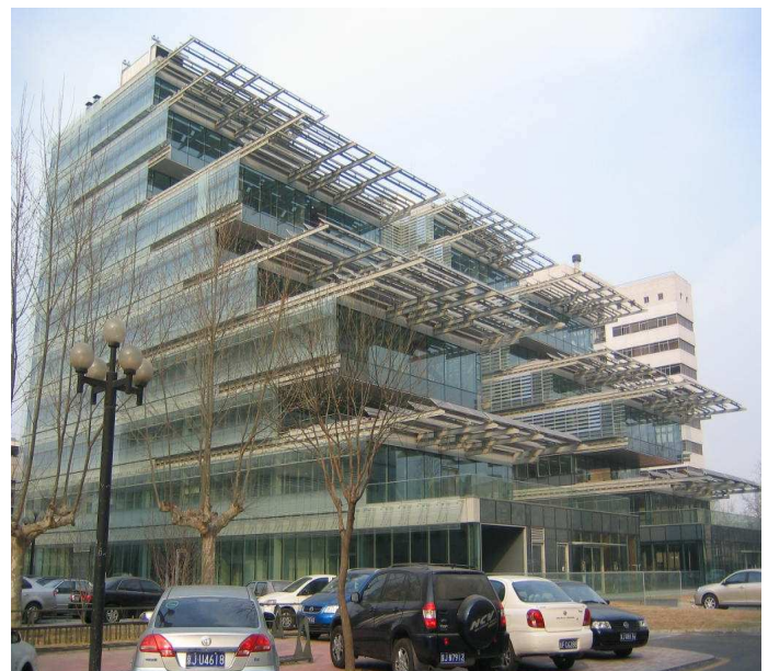
Fig. 3: Sino-Italian Environment & Energy Building at Tsinghua University, Beijing

The Sino-Italian Environment & Energy Building (SIEEB) is located on the campus of Tsinghua University in north-western Beijing and is financed by the Italian Ministry for the Environmental and Territory and the Tsinghua University, in the framework of the Sino Italian Cooperation Programme for Environmental Protection. Its design integrates ecological and energy-efficient technologies and shows the reduction potential of CO 2 -emissions in China's building sector. On nine stories, plus the ground floor and two stories below ground SIEEB provides a total floor space of 20,000 m 2 . The west wing of the symmetrical building is equipped with conventional water flush toilets, while the east wing is equipped with a vacuum urine diverting sanitation.